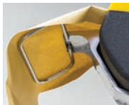
Quick and easy paper feed