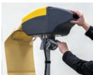
The X-FILL head can be tilted to precisely align the outfeed where required