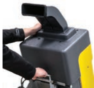
The X-PAD head can be tilted to precisely align the outfeed where required