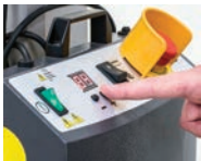
Simple to use digital control panel offers functional flexibility