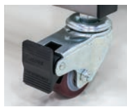
Lockable castors for extra stability