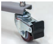
Lockable castors for extra stability