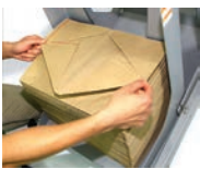
Quick and easy X-PAD paper reloading