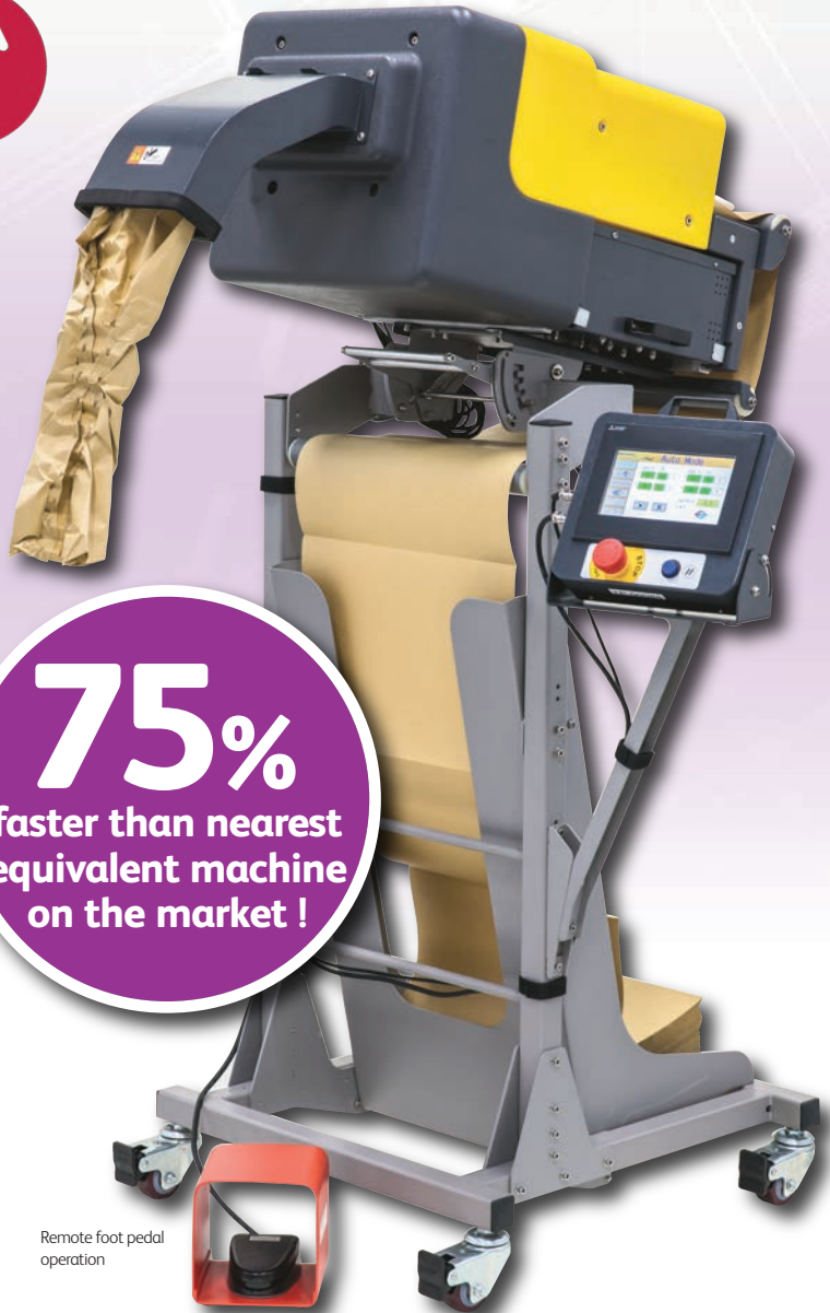
Remote foot pedal operation

75% faster than nearest equivalent machine on the market!