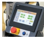
Digital touch screen control panel